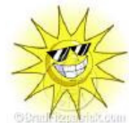
(Continued on page 3)

it's important because I get to spend not just "quality" time, but "quantity" time with my wife and kids. And, it's that quantity amount of time spent that brings about most of the memories. Unscheduled, flowing chatter from an 8 year, 6 year old and 3 year old are things that just can't be recaptured during the daily hustle and bustle of our lives. Heck, getting away from their activities (cheerleading, summer camp) and just let's them be kids. Something that doesn't seem to happen too often ~ at least not when I was growing up.